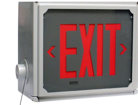
3/4" conduit entry hub